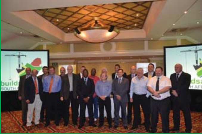
Representing the 18 founder members who signed the pledge during the launch of BuildSafe SA, including Aveng, Sasol, Foster Wheeler, Fluor, Murray & Roberts and NOSA.

associated stakeholders. BuildSafe SA advocates the free exchange and sharing of information between organisations working in the South African construction industry. It represents construction-related stakeholder organisations, who publicly expressed their commitment and dedication at the launch, to help improve the health, safety and welfare conditions of all workers through the free exchange of information.