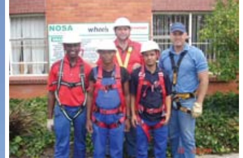
The NOSA Working at Heights team delivers training to employees of Transnet Rail Engineering (TRE) at most of its sites including Bloemfontein, Kimberley and De Aar. The training includes all TRE's safe access systems, installed lifelines and height safety PPE.